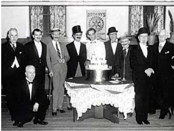
1955 年美國伊利諾州 Lacon 扶輪社的社員穿著當代衣著來增添扶輪 50 週年慶的光彩 Members of the Rotary Club of Lacon, Illinois, USA, dressed in period fashion, honor Rotary's 50 th anniversary, 1955