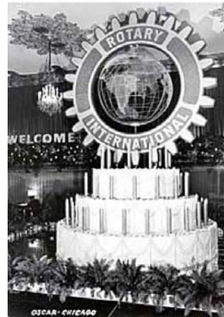
一個巨大的蛋糕其上有一個巨大的扶輪齒輪與地球，其日期不詳 A large cake with a large Rotary Wheel & globe on top, unknown date